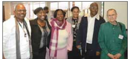
Staff members from the HIV/AIDS Centre together with staff from the Centre for Excellence in Learning and Teaching (CELT) and International Centre On Non-violence (ICON) at the HIV Curriculum Integration Workshop