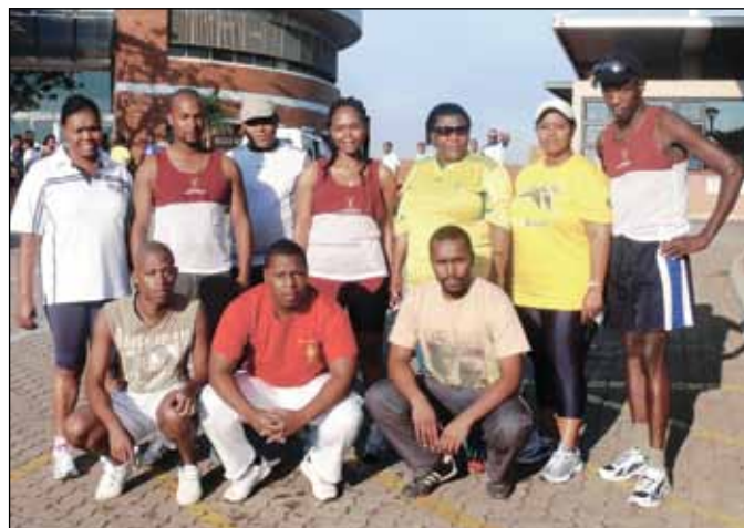
Staff and students from MUT who participated in the fun run during the wellness launch