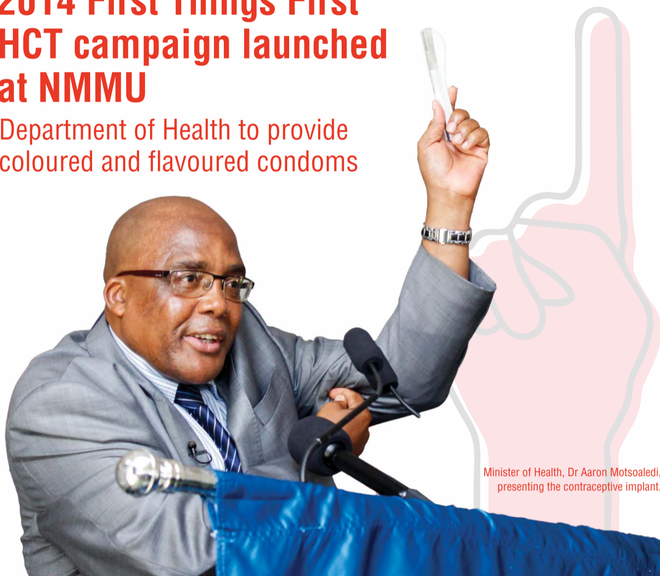
Minister of Health, Dr Aaron Motsoaledi, presenting the contraceptive implant.

Department of Health to provide coloured and flavoured condoms